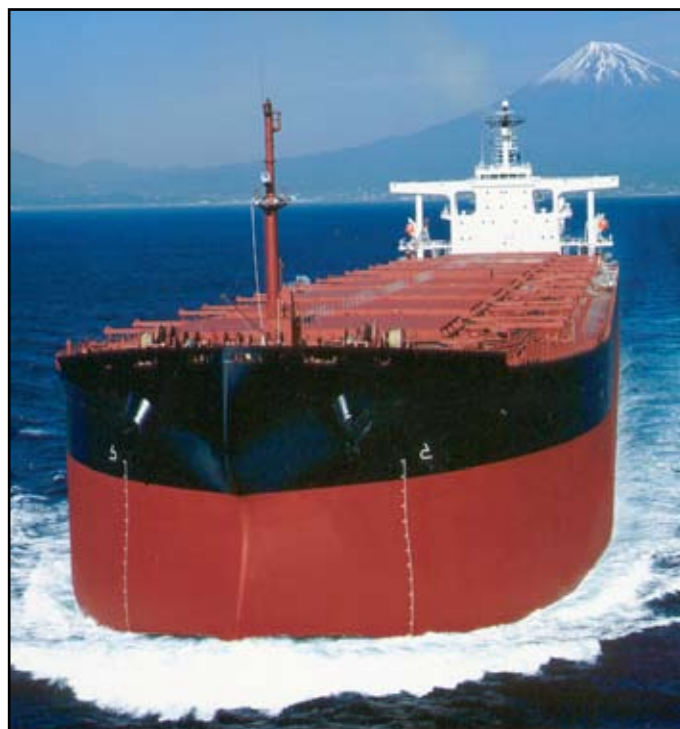
CDI is to embark on a ship inspection report scheme covering vessels carrying dry bulk cargoes on behalf of chemical companies

In 2006 the IT Committee will start their work on development of the new ISIS database to accommodate the 6th Edition and the Dry Bulk extension. The target date for the launch will coincide with the introduction of the new Integrated Ship Inspection System (ISIS) database in the second quarter of 2007.