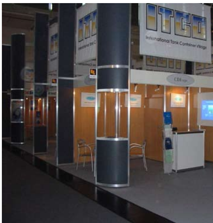
The CDI stand within the ITCO Tank Village at Munich

Throughout the development of CDI-mpc, the phrase "Industries Working Together" has been used. It is now extremely encouraging to see the ITCO membership demonstrating business and social responsibility through participation in the scheme. CDI remains committed in its association with ITCO.