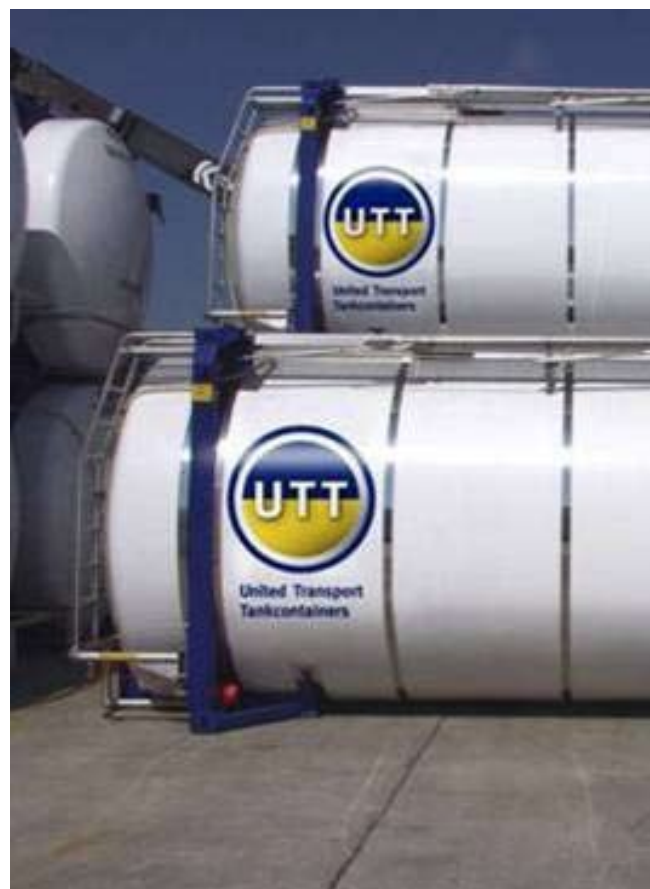
UTT swap body tank containers in their distinctive livery

The Houston premises of United Transport Tankcontainers (UTT) is the first site of a tank container operator to be audited under the CDI-mpc scheme in the US. UTT already has five of its sites in Europe audited to the scheme and plans are in hand to have its facilities in China similarly assessed.